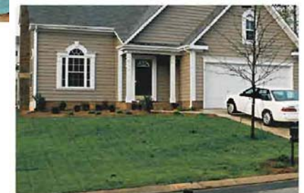
After just 3 weeks